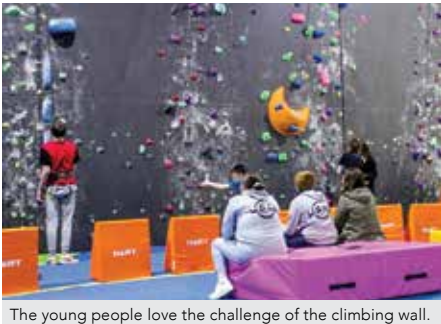
The young people love the challenge of the climbing wall.

Jasmine says many participants started out shy and introverted, but many who have left the program are now employed, seeking out study options or giving back through volunteering in community programs such as the Country Fire Authority. – Kirralee Nicolle