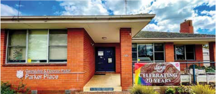
The LARF youth support service in Ballarat has been providing assistance to at-risk youth for two decades.

The LARF youth support service in Ballarat (Vic.) has been providing assistance to at-risk youth for two decades.