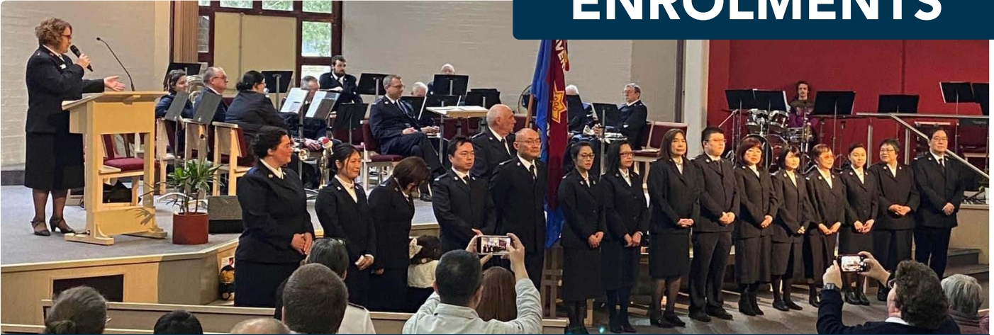
The 14 senior soldiers who were enrolled at Waverley Temple last month.